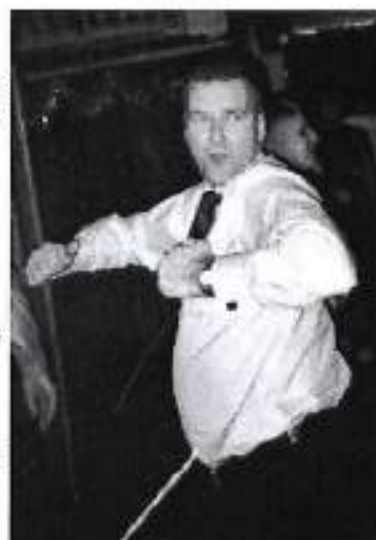
The Commodore, 'not dancing'

I believe this will be my last article in this section of the magazine so, as