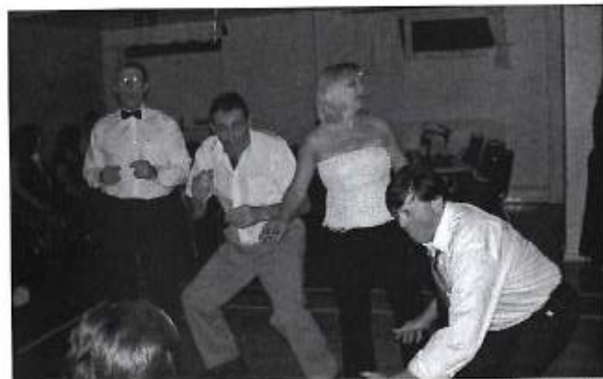
Club members caught behaving badly - place a deposit early with the Editor to avoid similar embarrassment.

Unfortunately, due to other commitments, there will be no New Year's Eve party at the Club this year, unless someone would like to organise something on behalf of the Club. If so, please let me know and I will arrange to spread the word.