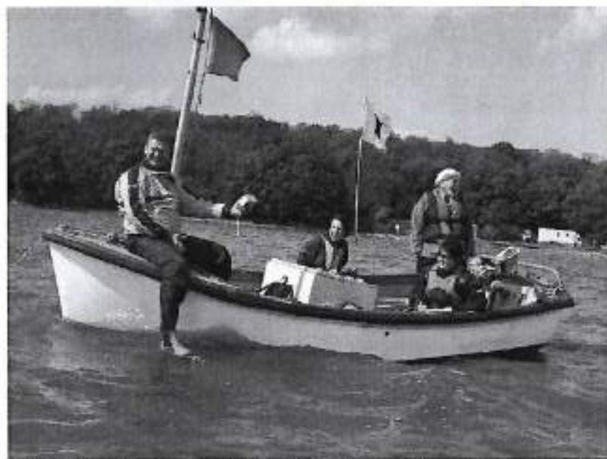
OK, this photo was actually taken at the Topper Open, but: committee boat start, Commodore's - you get the idea.