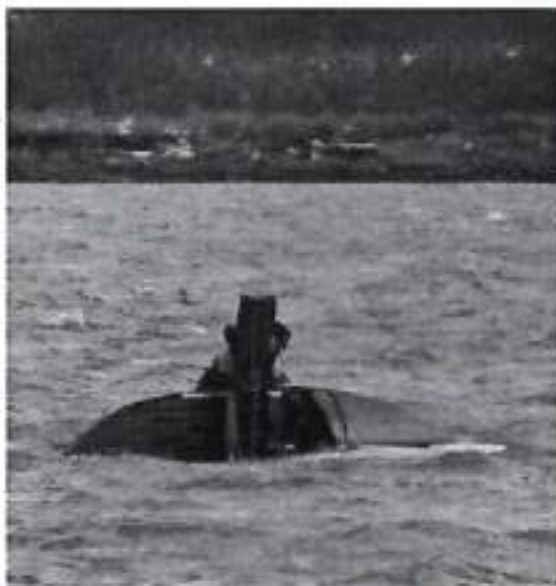
A capsized Canoe, & Simon Allen's, no less, in the '05 Freezer. Yes, there are snow patches in the background!

off the shroud there was only ever going to be one outcome to the whole event. Fortunately this did leave me in the perfect position to drop onto the dagger board which is of course very easy as its less than 20 inches from the edge of the boat!. My next surprise was a pleasant one, as just as I started to contemplate how on earth you're meant to right a capsized Canoe, the seat (being buoyant) floats up and provides a nice big handle with which to lean back on. Very convenient and with the tiller on a bit of elastic it comes up and sails off quite easily (well it does in a weak force 2!)