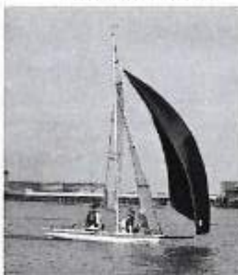
Holly Hewat showed that 3k's could be fast in light airs in the 3-Race Regatta.

Or use 'the box at the top of the stairs'